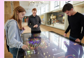
Play the Disease Controller game in Medicine and Communities

• Go to library and try to find some books like these: