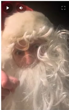
Don't let Santa down!

week, but they did really well and all of them actually said they enjoyed the test;