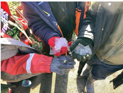
The Year 1 Team